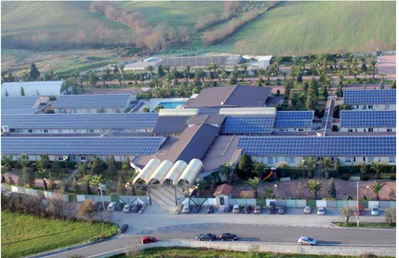
Castellón - Spain